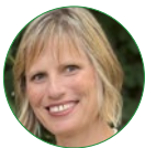
Victoria Carey Fine Vintage, USA