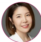
Meng Zhang Dragon Phoenix, China

A bursary is awarded to an APAC student to study a wine producing region.